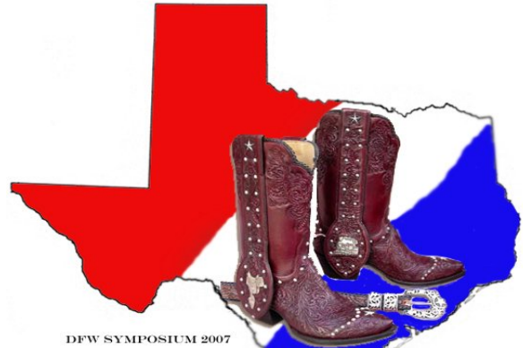
DFW SYMPOSIUM 2007

August 17, 2007 8 AM – 4:30 PM Arlington, Texas